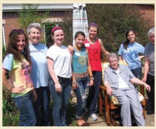
Individuals and groups – like these students from Beaumont School – provide valuable service to the congregation as participants in the new Ursuline Volunteer program.