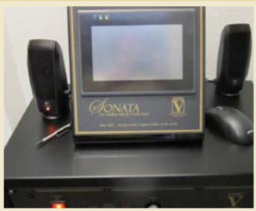
The new Sonata Bell System has reintroduced us to the beauty of bells.