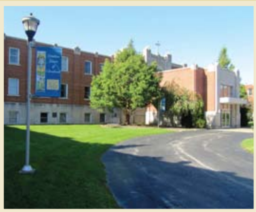
Efforts at simplifying our gardens and other planting bring out the natural beauty of our buildings and grounds.